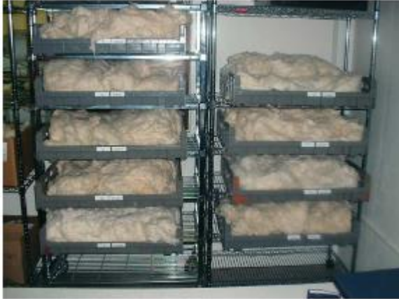
Figures: Storage of samples for conditioning [Uster Technologies]

(Recommendations) It is important to undertake regular checks of the moisture content of the cotton samples. For Upland cottons, the moisture content should not exceed the range of 6.75 to 8.25% (dry basis) and should not vary by more than 1 percentage point from that of the Calibration Cottons. Out of range samples should be allowed additional conditioning time. If the range is still not achieved, then the sample should be marked as exceptional.